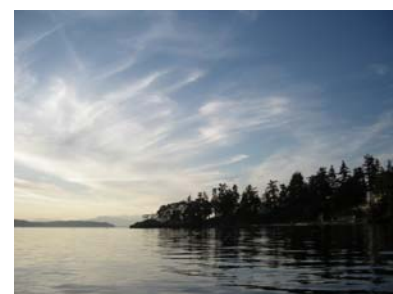
Coal Point and beyond