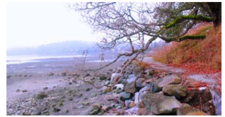
Pat Bay in the fog