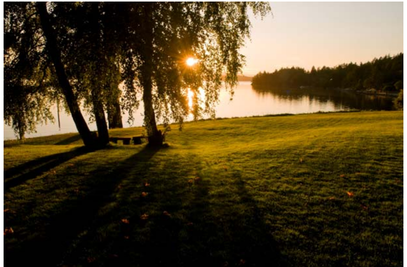
Sunset at Chalet Beach (one of North Saanich's submissions to Picture BC)

Visit www.picturebc.ca for a “virtual” tour of our amazing province and witness the beauty and charm of everything we have to offer. You might find yourself planning a vacation soon!